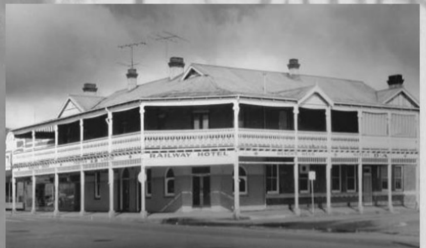
The Railway Hotel