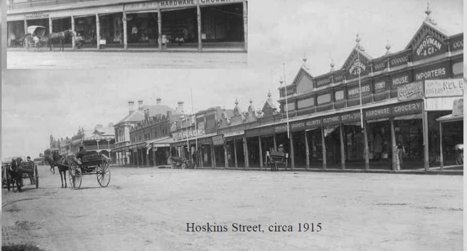
Hoskins Street, circa 1915