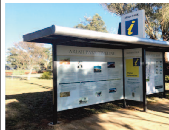
New visitor information bays have been erected in the region

What: Temora Disability Expo When: Friday 29th March Where: Temora Ex-Services Memorial Club Time: 10am – 3pm