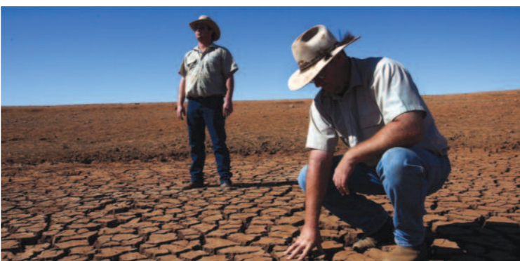
Drought preparedness is part of the Farmer Education Funding Program.

For more information please contact the BEC events team at events@becadvice.com.au or 02 6024 0400, 02 6925 6588, contact Council's Customer Service team or visit https://mybusiness.service.nsw.gov.au/https://mybusiness.service.nsw.gov.au/