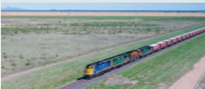
More information will be made available to community members regarding the Illabo to Stockinbingal section of the Inland Rail route.

For further information on the Program, including eligibility requirements, application and assessment processes, and frequently asked questions, please visit inlandrail.artc.com.au/sponsorships If you have any questions, please email communitysponsorships@artc.com.au .