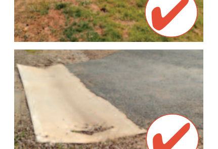
Examples of how nature strip drainage problems should be rectified.