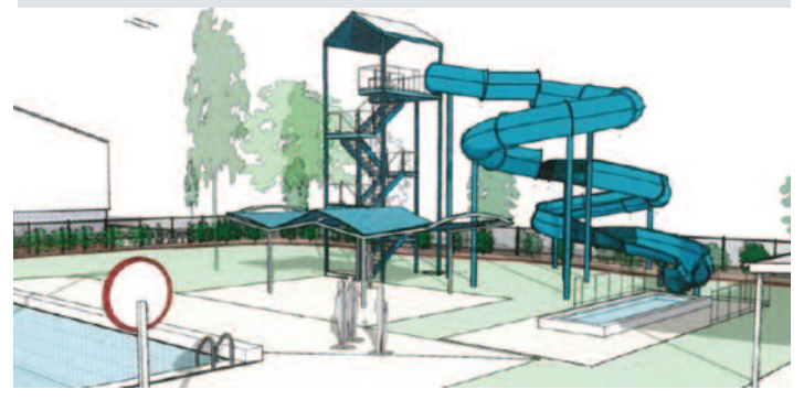
A close up view of the proposed water slide.

"Council is thrilled with the announce ment," says Ms Golder "These projects will benefit residents and visitors to our shire for generations to come"