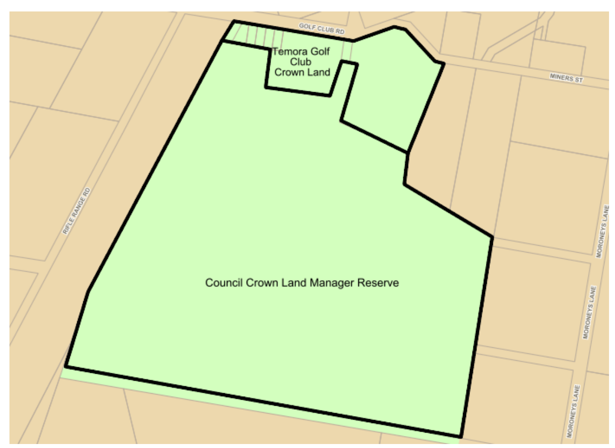
Figure 1: Zoning map indicating the Council Crown Land Manager Reserve and the Temora Golf Club managed Crown Land.

Figure 2 provides an aerial image of the site.