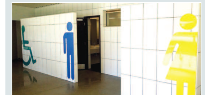
Pictured above: The completed upgrade of amenities at the Temora Recreation Centre.

THE NSW Government's Stronger Country Communities Fund delivers local infrastructure to improve the quality of life for people in regional NSW. Funding was provided to councils for projects such as parks, community halls, sports facilities, playgrounds and amenity blocks. Council has completed its first project under the Stronger Country Communities Fund, which was the upgrade of the Temora Recreation Centre amenities. The first stage of the upgrade to the Arah Park Recreation Ground amenities building and the Temora West Sports Ground amenities building are also nearing completion. Works at the Temora Memorial Town Hall are well underway, with internal refurbishment nearing completion and the foyer extension commenced. Other projects at Nixon Park, Temora Tennis Club, Temora Golf Club, Temora netball courts, Lake Centenary, the Arah Park's Coolamon Street, and town entrances will commence later in the year or early 2020.