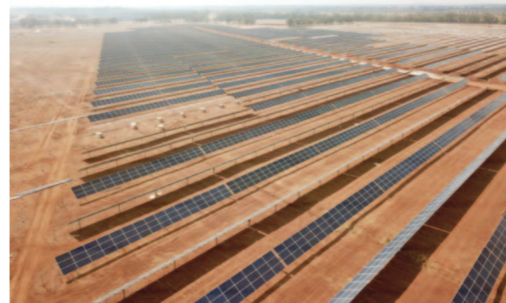
The Sebastopol Solar Farm