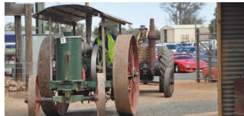
Step back in time at the 47th Annual Live Exhibition at the Bundawarra Centre on Saturday, March 14. A fun day for the whole family.

LEGO Club— 02/03, 4pm Autumn Booksale — Starts 02/03, everything $2