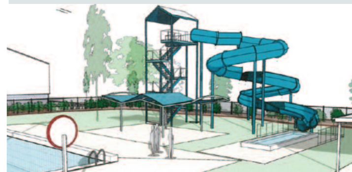
A close up view of the proposed water slide.