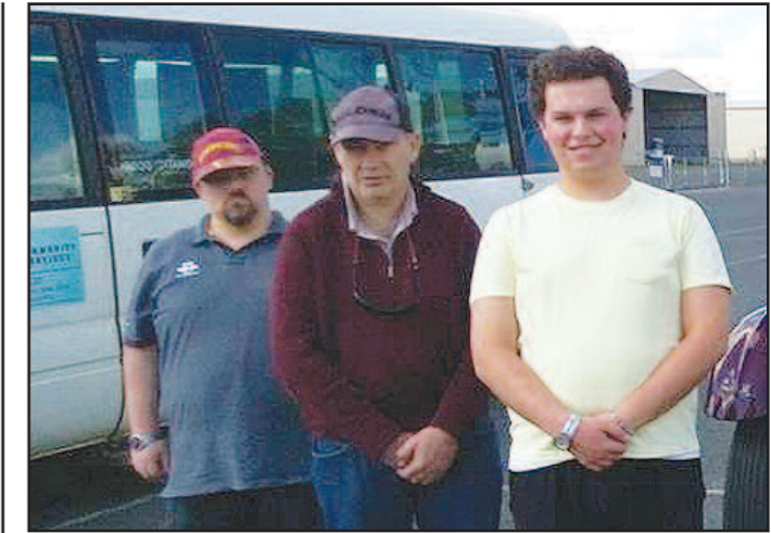
Pictured: Members of the Men's Pinnacle Group who enjoy regular use of the Pinnacle Transport vehicle.