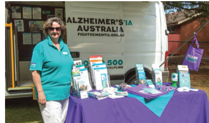
Pictured: Many service providers will be in attendance at this years Active Ageing Expo on Friday, June 25 at the Temora Memorial Town Hall from 9.30am-2.30pm.