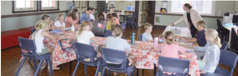
Youth enjoying a Platform Y Painting Workshop held earlier this year.

For more information: Ph: 1800 931 603; Fax: 02 6921 9911; Email: can@mphn.org.au If you or someone you know is experiencing a mental health crisis, please call Murrumbidgee AccessLine on 1800 800 944 (24 hours)