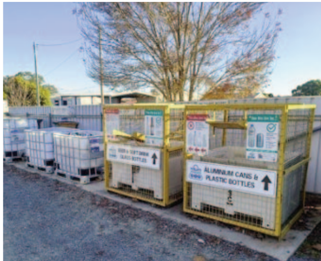
Rubbish collection areas are clearly labelled.

RECYCLING has become an essential aspect of modern everyday life in households, and in Temora it is no less important – only we do it a little differently. Kerbside recycling collection can be very convenient, but with that convenience comes extra cost to the rate payer. We have numerous recycling schemes within our community, and unlike many recycling schemes elsewhere, ours do not cost ratepayers exorbitant extra fees – in fact, all our recycling is offered for FREE.