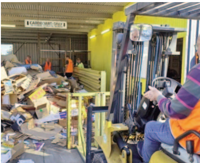
A dedicated Lions Club Member hard at work.