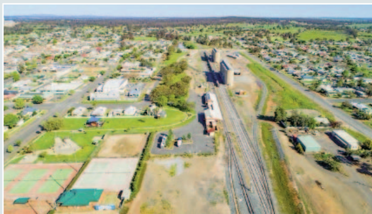
Council has received funding towards the redevelopment of the Temora Railway Precinct.