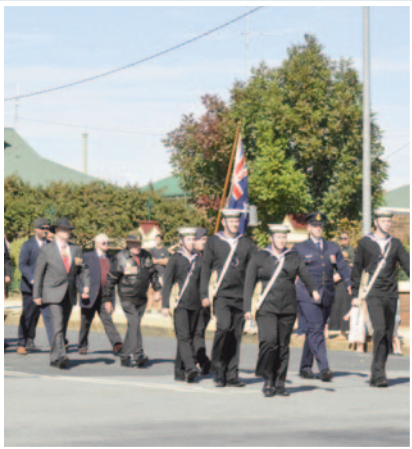
Temora Anzac Day March - Service representatives old and new.