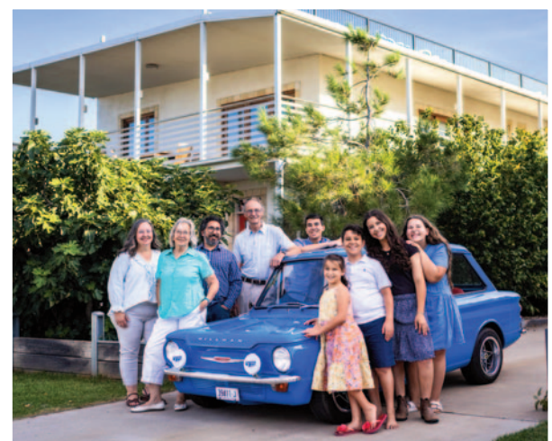
The Wootton and Solimon Families located to Temora.

For more information, visit countrychange.com.au