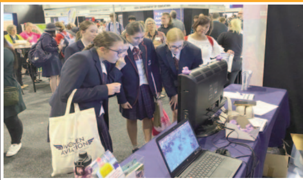
Career and Volunteers Expo's are a great source of information. Book your stand with TAFE now.