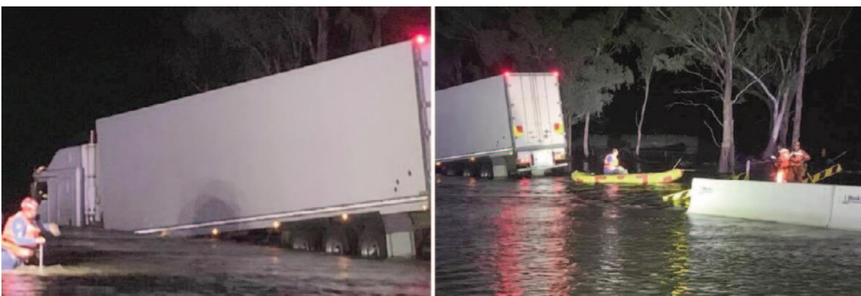
Pictured: Temora and Junee SES in action rescuing truck driver in flood waters.