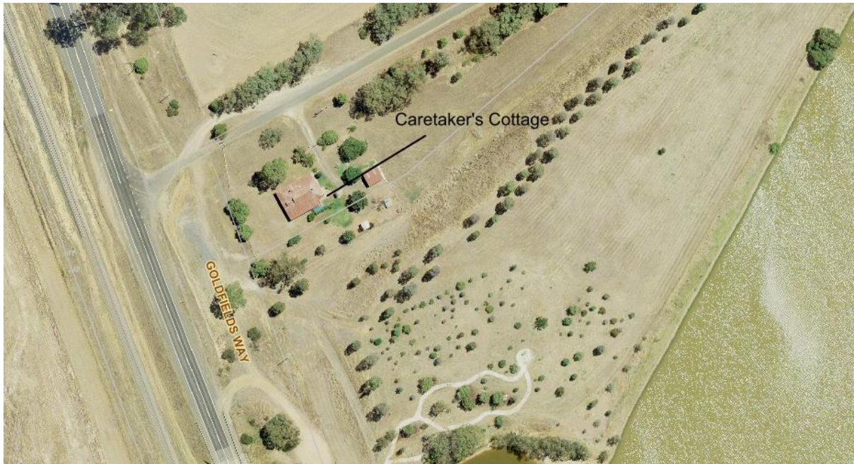
Figure 4: Location of Caretaker's Cottage at Lake Centenary