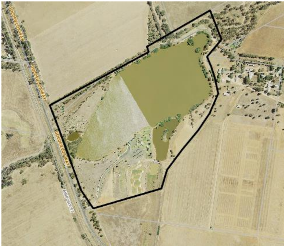
Figure 1: Aerial image of the boundary of Lake Centenary Crown Reserve

This Plan of Management applies specifically to Crown Reserve No. 97212 for Public Recreation, known as Lake Centenary, made up of Lots 1211 and 1212 in Deposited Plan 45494. These parcels of land total approximately 55 hectares and front Goldenfields Way, approximately 4.5 kilometres north of Temora town centre. The land is located in the Temora Shire Council Local Government Area in New South Wales and within the State electorate of Cootamundra.