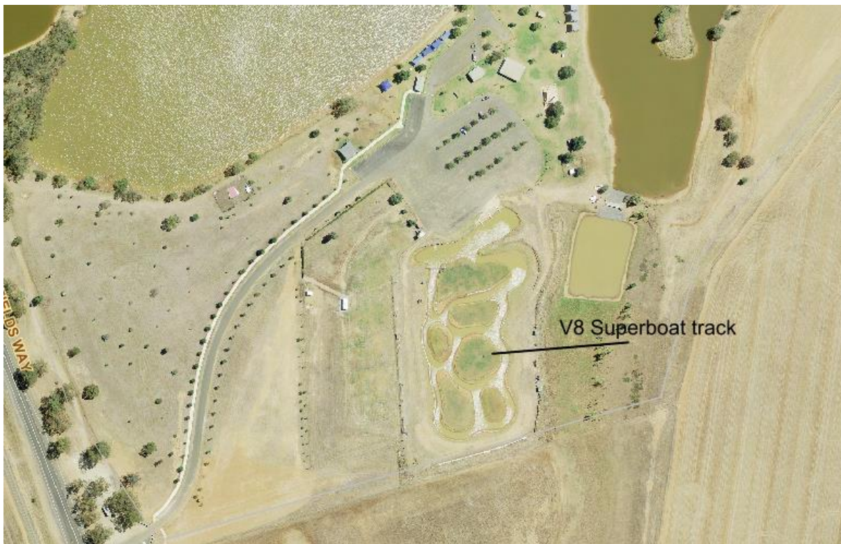
Figure 5: Location of V8 Superboat track Lake Centenary

The remainder of the Lake Centenary precinct is currently unrestricted, open access to the public for recreation purposes pursuant to the purpose of the Crown Reserve and consistent with the core objectives for management of the land categorised as a park under section 36G of the Local